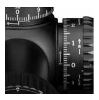
Aligning "0" marks.