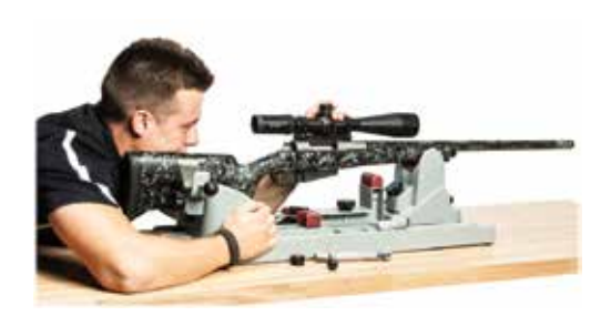
Visually boresighting a rifle.

After rifle is boresighted, do not re-tighten elevation zero stop lock screws on inner turret or replace the outer turret cap. This will be done after the final range sight-in is complete.