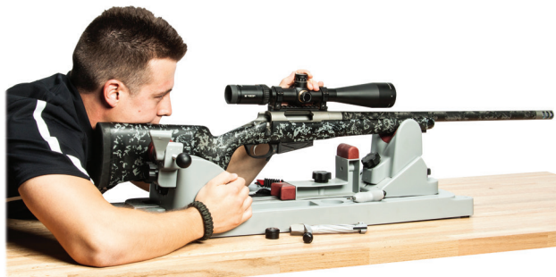
Visually bore-sighting a rifle.