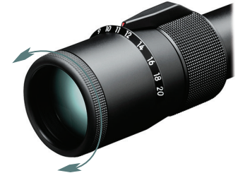
Adjust the reticle focus

TIP: Try to make this particular adjustment quickly as your eye will try to compensate for an out-of-focus reticle.