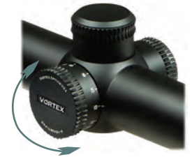
Adjust the side focus knob

Parallax is a phenomenon that results when the target image does not quite fall on the same optical plane as the reticle within the scope. When the shooter's eye is not precisely centered in the eyepiece, there can be apparent movement of the target in relation to the reticle, which can cause a small shift in the point of aim. Parallax error is most problematic for precision shooters using high magnification.