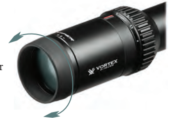
Adjust the reticle focus

Once this adjustment is complete, it will not be necessary to re-focus every time you use the riflescope. However, because your eyesight may change over time, you should re-check this adjustment periodically.