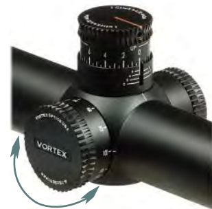
Adjust the side focus knob