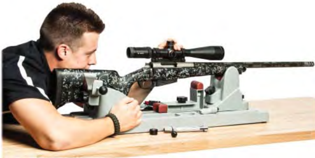
Visually bore-sighting a rifle.