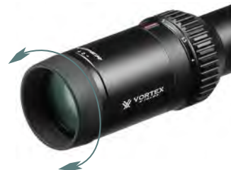
Adjust the reticle focus

Note: Try to make this particular adjustment quickly, as the eye will try to compensate for an out-of-focus reticle.