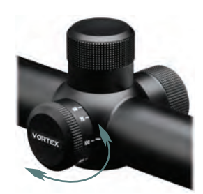
Adjust the side focus dial

3. Check for parallax error by moving your head back and forth while looking through the scope. The focus is correct if there is no apparent shift of the reticle on the target. If you notice any shift, adjust the focus knob slightly until all shift is eliminated.