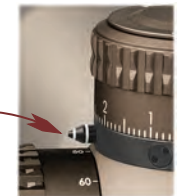
Turret in third turn of rotation (fully extended).

Note: Some combinations of rifle, base and rings may not allow a second or third rotation of the elevation turret.