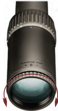
Adjust the reticle focus.

Once this adjustment is complete, it will not be necessary to re-focus every time you use the rifle scope. However, because your eyesight may change over time, you should re-check this adjustment periodically.