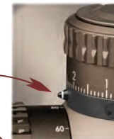
Turret in second turn of rotation (partially extended).