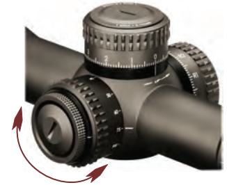
Rotate Side Focus Dial

Parallax is a phenomenon that results when the target image does not quite fall on the same optical plane as the reticle within the scope. This can cause an apparent movement of the reticle in relation to the target if the shooter's eye is off-centered. Correctly focusing the target image will allow it to fall on the same optical plane as the reticle within the riflescope.