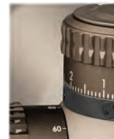
Turret in first turn of rotation (not visible).

The external indicator on the elevation turret provides quick visual and tactile reference of the elevation turret's rotational position. As the turret enters the second turn of rotation, the indicator will extend outward from the turret. On the third turn of rotation, the indicator will be fully extended.