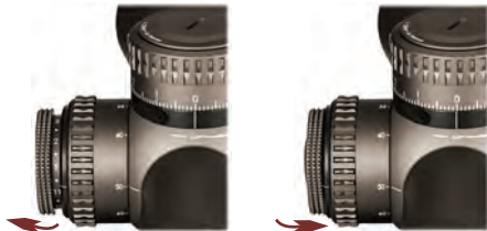
Pull out to unlock and adjust.

To activate the illumination, pull out the dial and adjust by rotating the adjustment dial in either direction. The illumination dial allows for 11 levels of brightness intensity; an off click between each level allows the shooter to turn the illumination off and return to a favored intensity level with just one click.