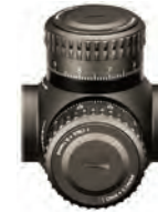
MRAD Models "1 Click = 0.1 MRAD"

MOA unit of arc measurements are based on degrees and minutes. There are 360 degrees in a circle and 60 minutes in a degree for a total of 21,600 minutes (MOA) in a circle. A minute of angle will subtend 1.05 inches at a distance of 100 yards (29.1 mm at 100 meters). Razor HD riflescopes with MOA adjustments use .25 minute clicks which subtend .26 inches at 100 yards (7.3 mm at 100 meters), .52 inches at 200 yards (14.6 mm at 200 meters), .78 inches at 300 yards (21.9 at 300 meters), etc.