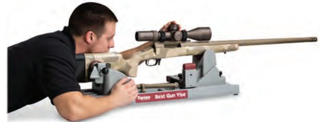
Visually bore-sighting a rifle.

Note: Be sure to read pages 11–12 prior to making adjustments.