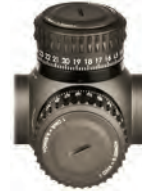
MOA Models "1 Click = 0.25 MOA"