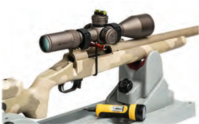
Using bubble levels to square the riflescope to the base.