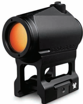
High Mount / Lower 1/3 Co-Witness