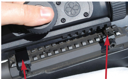
Front Cross Bolt assembly with Plate